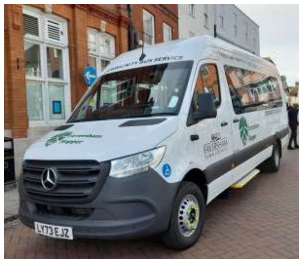
The Faversham Hopper Community Bus

More information can be found at: www.favershamtowncouncil.gov.uk/active-travel/community-bus-service/