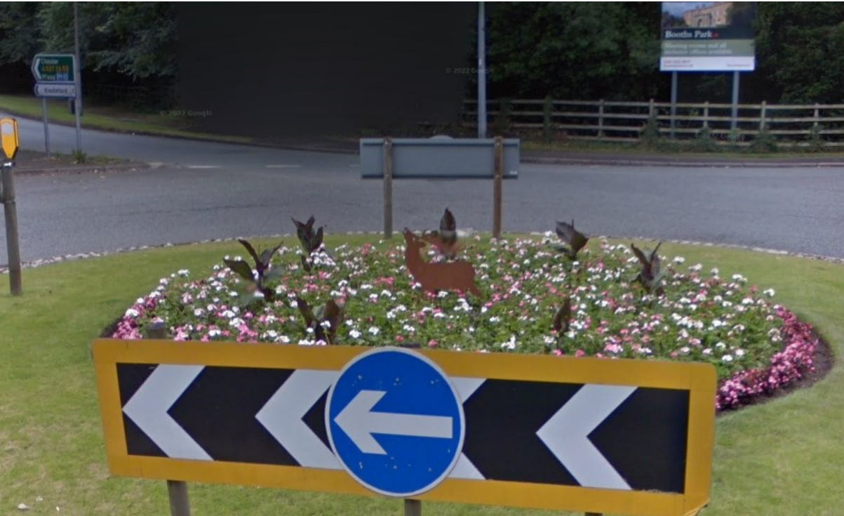
Former feature on Chelford Road roundabout