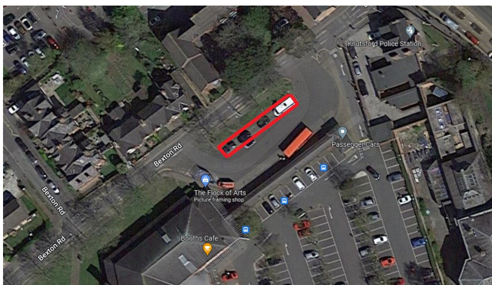
Figure Two: Location of proposed coach parking