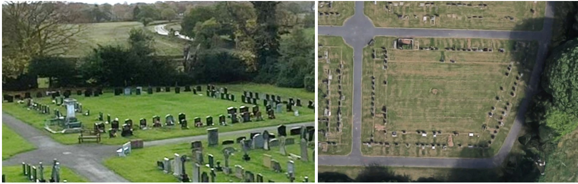
The open section of section G as picture from the chapel tower (left) and satellite imagery (right)

To create the paths, a width of turf-reinforcement mesh roll would be rolled over the existing turf and pinned. As the grass grows through the plastic mesh holes, the grass roots interlink with the mesh filaments creating a stable surface that helps to protect grass from wear and enables it to support greater footfall providing a surface over which wheelchairs can more easily be used. This is a simpler and significantly lower cost option than creating tarmac paths and would complement the soft landscaping of the garden.